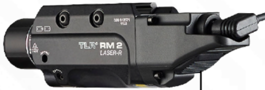
Ergonomic push-button switch